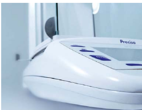
Designed along smooth, flowing lines