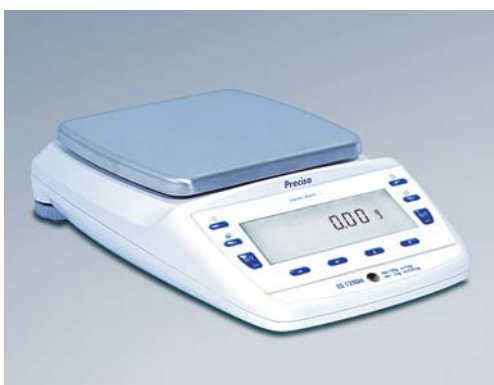
Compactly styled shape