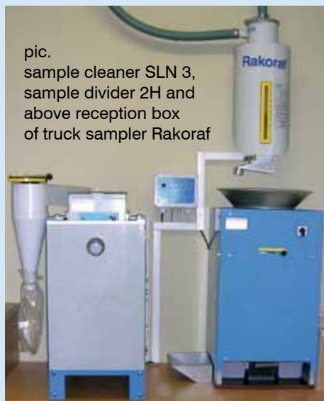
pic. sample cleaner SLN 3, sample divider 2H and above reception box of truck sampler Rakoraf

We reserve the right to make technical modifications!