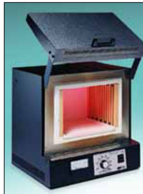
C Manual Version Vulcan A-130/Vulcan A-550