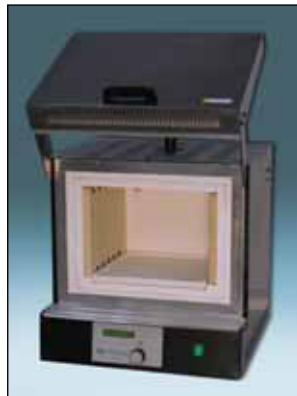
B Manual Version-digital display Vulcan D-130/Vulcan D-550