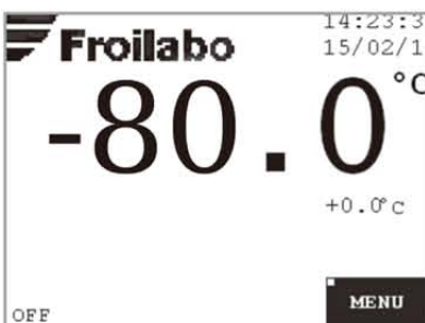
Écran tactile sur le BMS